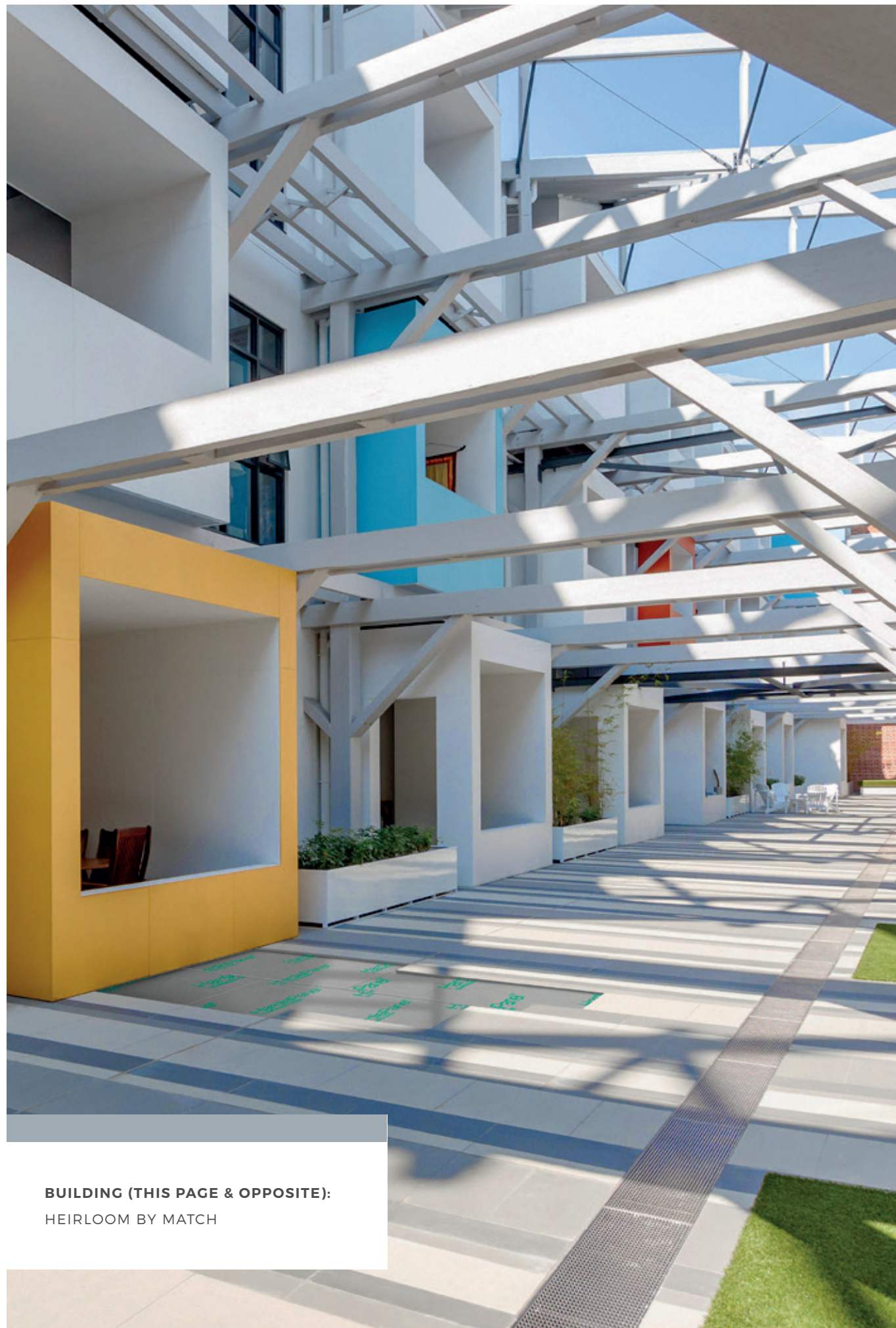
BUILDING (THIS PAGE & OPPOSITE): HEIRLOOM BY MATCH